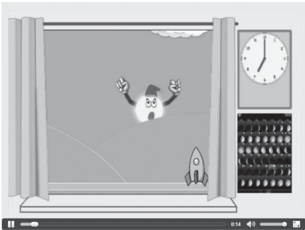
Fig.2 A screen shot of the daily motion of the Sun in Uchu Game.