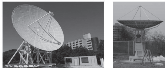
Fig.4 A part of introduction of IfES's latest radio antennas and their functions. The material was prepared by Sato.