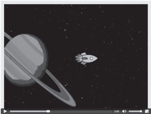
Fig.3 A screen shot of the solar system grand tour in Uchu Game.

Dušan performed together. Uchu Game, a package of electronic astronomy education materials developed by us, was presented (see figure 1). Children enjoyed the daily cycle of the Sun and the Moon motions with lovely characters, and the imaginary space trip by a nice rocket through solar system (see figures 2 and 3). Children were also eager to ask Dušan questions. Tomita translated children's Japanese into English.